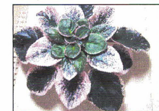
Culture break; recent toxic conditions.

Different species of plants have different pH requirements and levels at which micro-nutrients are toxic to the plant, and the genetics of the plant may determine why some cultivars are more susceptible than others. From observations of my violets, variegates were the first to show symptoms and some cultivars, both variegated and green foliage, were more susceptible than others. Trailers weren't as affected as standards, but when trailers did develop toxicity symptoms, the plant developed many tight crowns with leaves that were very small and brittle. The semi-minatures were the first to show signs of trouble and the first to go to the compost. Other gesneriads may have different pH requirements. Chiritas and some other gesneriads do well at pH closer to 7.0, and with the low pH soil I was using, most of the other gesneriads in my collection did not survive. Most general information on pH and plants