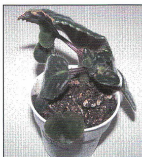
Mother leaf from toxic plant with one deformed plantlet.

suggests that plants need pH levels at 6.0 or above to thrive. The ideal pH range for African violets is slightly acid soil having a 6.5 to 6.8 pH. The mix I was using with reverse osmosis water tested well below 5.5, the lowest the pH test strips measured, which is about 50 to 100 times too acid.