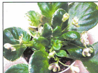
'Frozen In Time' shows deformed center, culture break, brittle older leaves, deformed blossoms and suckers.

What is pH? pH is a measure of the degree of acidity or alkalinity of a substance. It is an arbitrary scale of values set from 0 (strong acid) to 14 (strong alkaline) with 7.0 as