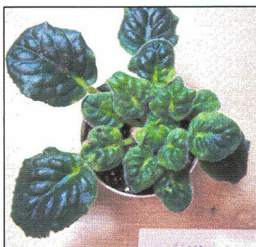
Culture break; showing color change in foliage.

Since the problem has been identified, I have read everything I could find