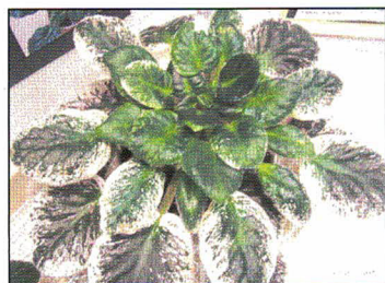
Older plant showing effects of micronutrient toxicity over period of several months.

By the time a diagnosis of micronutrient toxicity was made I had exhausted all possibilities – too much light, not enough light, too much fertilizer, not enough fertilizer, mites, other pests, change this, throw out plants, change that, throw out more plants. Micronutrient toxicity is irreversible; the plants will not grow out of the toxicity, and leaves and