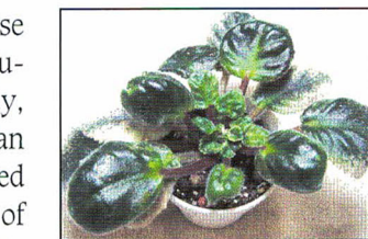
'Alliance' shows most of the symptoms of micronutrient toxicity - brittle, deformed older leaves, color change, culture break, and small, deformed center.

neutral (neither acid or alkaline). Distilled water is an example of neutral pH. The pH scale is exponential and indicates the relative strength of the acidity-alkalinity of a substance. A unit change in pH represents a ten-fold change in acidity or alkalinity. A soil of 6 is ten times as acid as one of pH 7. A soil of pH 5 is one hundred times