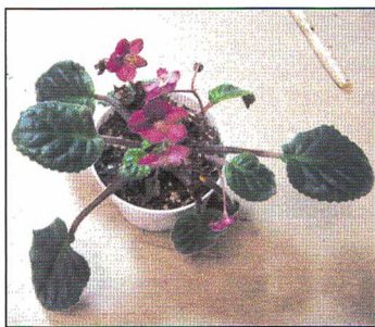
Deformed blossoms; culture break.

leaves, showed toxicity symptoms within a few weeks and were sent to the compost along with most of the plants in my collection. Sad, but my trays were clean! I had to find out more.