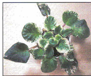
Shows culture break, deformed and twisted foliage.

What to look for? Micronutrient toxicity syndrome is the accumulation over time of excessive levels of trace