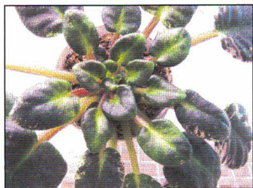
Culture break; brittle foliage; tight, deformed center; color change; suckers; center leaves twisted. Young plantlet from plantlet that appeared normal when removed from mother leaf taken from plant in photo 2.

Where do I start my saga? With the desire to have clean trays? With the pH of the soilless mix and water? With my “head in the sand” concerning the symptoms I was seeing in my plants? Diagnosing and solving the problem with the plants in my collection has been a learning experience that I want to share, hoping that it will prevent others from experiencing the same disaster.